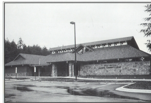
▲ The Albert Carlton - Cashiers Community Library.